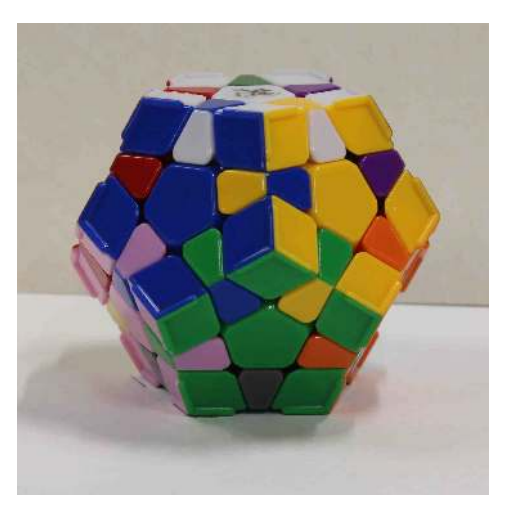
(b) The superflip